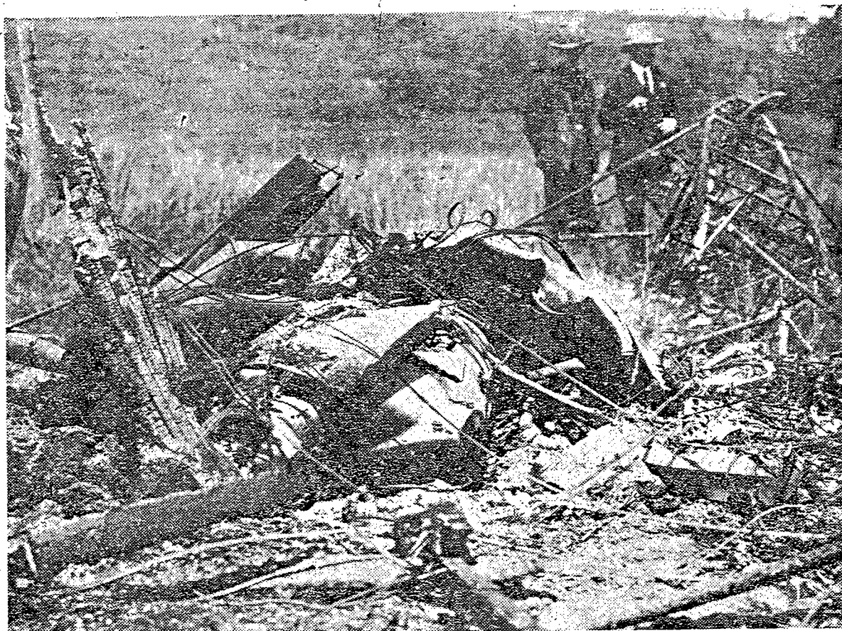
The still-smouldering wreckage of the Air Force aeroplane which crashed outside Healesville, today.