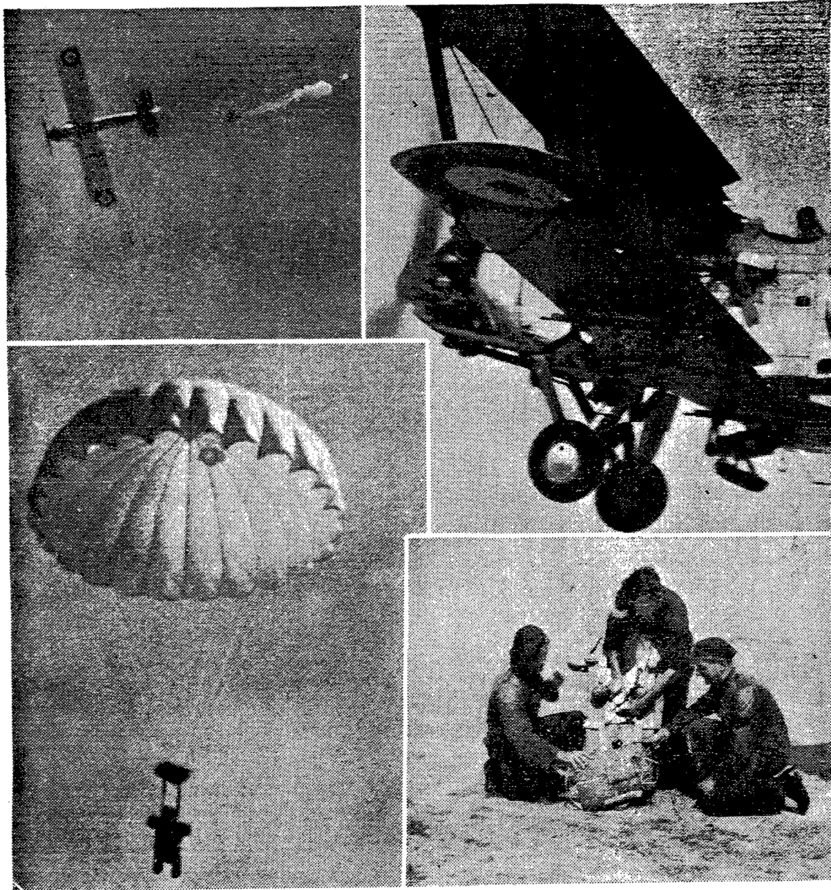
Parachutes from England for the additional pilots to be enlisted in the Royal Australian Air Force under the defence expansion plan were tested yesterday at Laverton. More than 30 parachutes were test-dropped from the plane which is shown taking off (top right) with some of the parachutes packed in the under section of the lower wing. (Lower right) Preparing the parachute gear. A strictly enforced rule in the R.A.A.F. is that all personnel going "aloft" must wear parachutes.